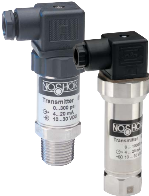
High pressure model